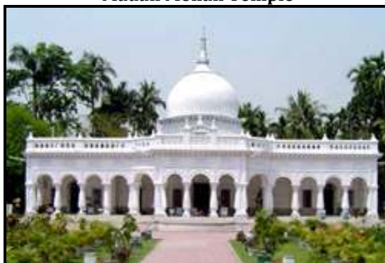
Madan Mohan Temple

Rajpath Mount: It is located 35 km. away from the town Cooch Behar wherein remnants of a palace protected by ASI (Archaeological Survey of India) can be noticed.