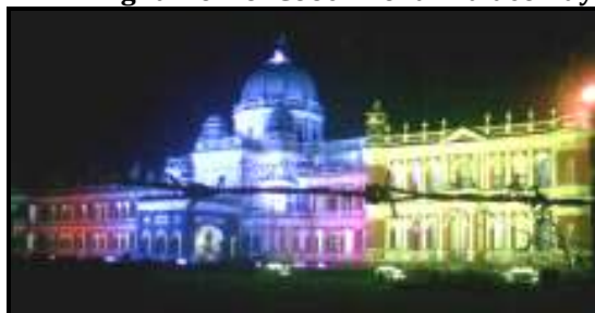
Night View of Cooch Behar Palace Day View of Cooch Behar Palace

Cooch Behar Palace: The palace was built in 1887 following classical European style in order to rule Koch dynasty by Maharaja Nripendra Narayan. The interior decoration of it was completed in 1898. The length and width of the palace are 400 feet and 300 feet respectively with a monument of 120 feet height. This magnificent royal structure of marble with its beautiful garden has been bearing the story of its glorious past.